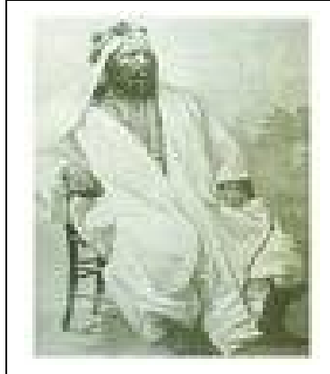
Ras Alula Aba Nega